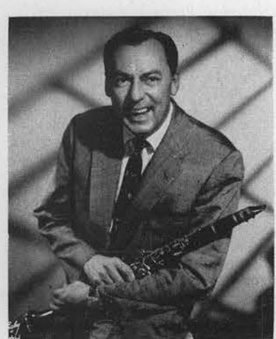
Woody-Man of Jazz Fame

Woody Herman's Band is rated as the top jazz and swing band of the